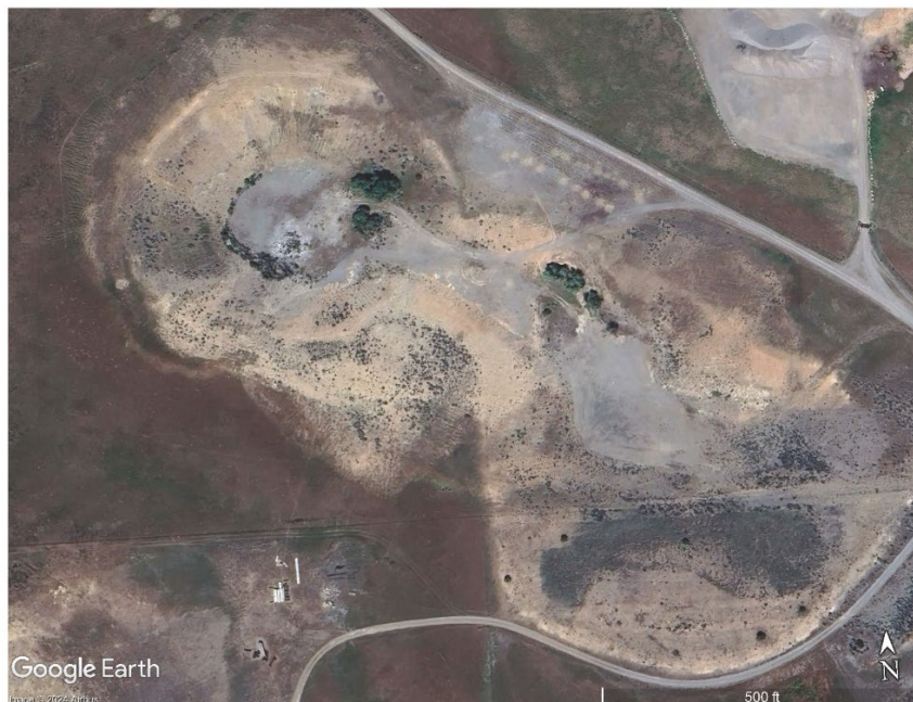
Figure 2: L&C Livestock Quarry- Aerial Image showing existing site conditions (5/20/2023)

As the permit has not been used for purpose approved for more than a year since mining commenced, the permit automatically terminated and to formalize the termination of the Use Permit, staff believe it is appropriate for the corresponding use permit to be revoked in accordance with Siskiyou County Code Section 10-6.1402.