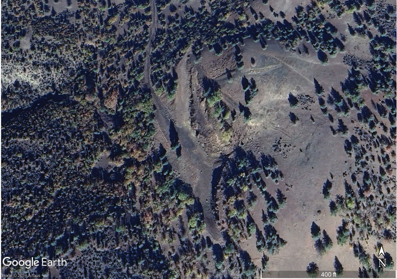
Figure 2: JJJ Quarry - Aerial Image showing existing site conditions (11/3/2023)