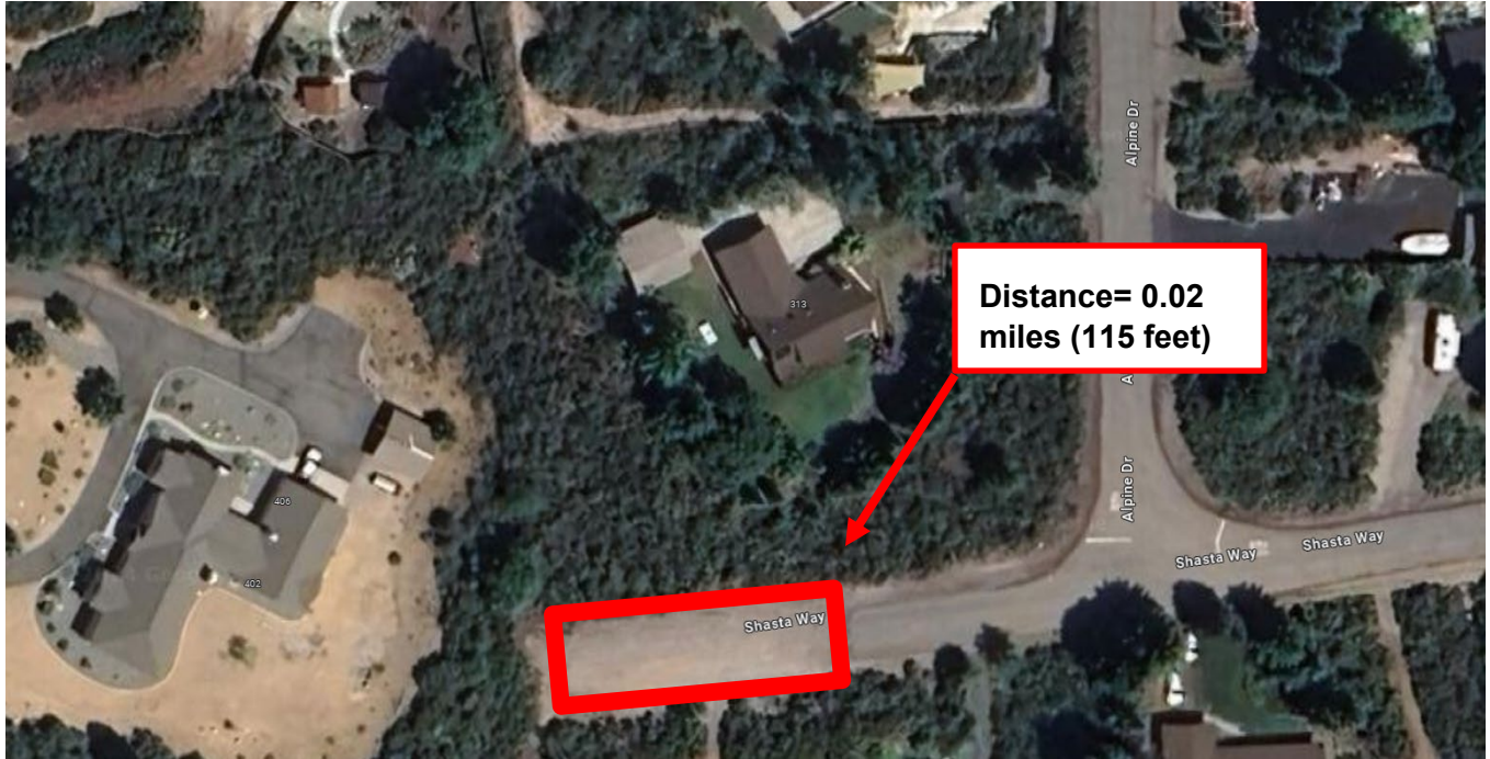
Figure 2: Portion of Road to be Abandoned